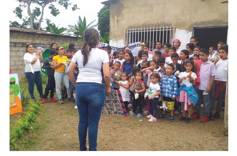
VENEZUELA The church reaches out to neighborhood children with God's love.

BELOW THE PHILIPPINES The church continues to grow.